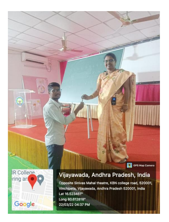
Resource person offering gift to student winners (Puzzle Solving)