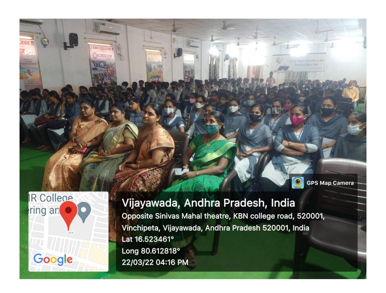
Staff & Students at the Guest Lecture